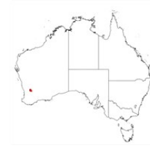
Acacia yorkrakinensis subsp. yorkrakinensis occurrence map. Occurrence map generated via Atlas of Living Australia ( https://www.ala.org.au ).