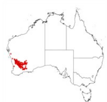
Acacia yorkrakinensis subsp. acrita occurrence map. Occurrence map generated via Atlas of Living Australia ( https://www.ala.org.au ).