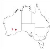
Acacia xerophila var. xerophila occurrence map. Occurrence map generated via Atlas of Living Australia ( https://www.ala.org.au ).