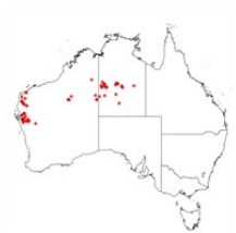
Acacia wiseana occurrence map. Occurrence map generated via Atlas of Living Australia ( https://www.ala.org.au ).