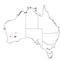
Acacia websteri occurrence map. Occurrence map generated via Atlas of Living Australia ( https://www.ala.org.au ).