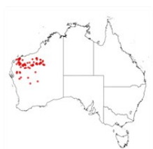
Acacia wanyu occurrence map. Occurrence map generated via Atlas of Living Australia ( https://www.ala.org.au ).