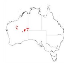
Acacia walkeri occurrence map. Occurrence map generated via Atlas of Living Australia ( https://www.ala.org.au ).