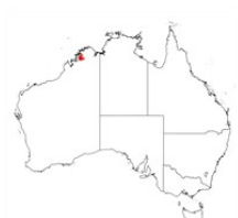
Acacia vincentii occurrence map. Occurrence map generated via Atlas of Living Australia ( https://www.ala.org.au ).