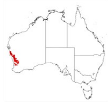
Acacia ulicina occurrence map. Occurrence map generated via Atlas of Living Australia ( https://www.ala.org.au ).