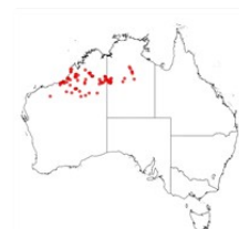
Acacia tumida var. kulparn occurrence map. Occurrence map generated via Atlas of Living Australia ( https://www.ala.org.au ).