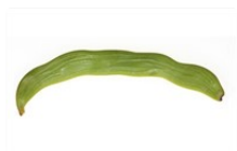
Source: WorldWideWattle ver. 2. Published at: www.worldwidewattle.com Kym Brennan