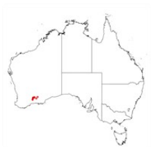
Acacia truculenta occurrence map. Occurrence map generated via Atlas of Living Australia ( https://www.ala.org.au ).