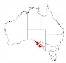
Acacia triquetra occurrence map. Occurrence map generated via Atlas of Living Australia ( https://www.ala.org.au ).