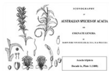
See illustration.