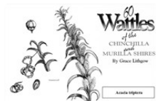
See illustration.