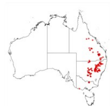
Acacia triptera occurrence map. Occurrence map generated via Atlas of Living Australia ( https://www.ala.org.au ).