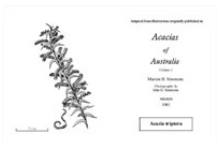
See illustration.