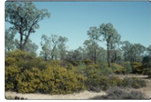
Source: Australian Plant Image Index (a.31359). ANBG © M. Fagg, 1993