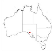
Acacia toondulya occurrence map. Occurrence map generated via Atlas of Living Australia ( https://www.ala.org.au ).