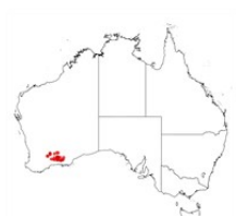
Acacia tetraptera occurrence map. Occurrence map generated via Atlas of Living Australia ( https://www.ala.org.au ).