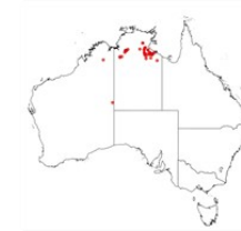
Acacia subternata occurrence map. Occurrence map generated via Atlas of Living Australia ( https://www.ala.org.au ).