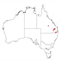
Acacia striatifolia occurrence map. Occurrence map generated via Atlas of Living Australia ( https://www.ala.org.au ).