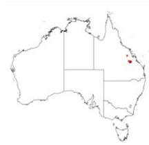
Acacia storryi occurrence map. Occurrence map generated via Atlas of Living Australia ( https://www.ala.org.au ).