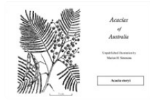
See illustration.