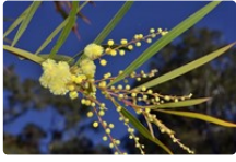
Source: Australian Plant Image Index (dig.31504). ANBG © M. Fagg, 2013