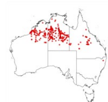
Acacia stipuligera occurrence map. Occurrence map generated via Atlas of Living Australia ( https://www.ala.org.au ).