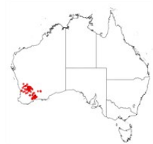
Acacia sessilispica occurrence map. Occurrence map generated via Atlas of Living Australia ( https://www.ala.org.au ).