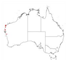
Acacia ryaniana occurrence map. Occurrence map generated via Atlas of Living Australia ( https://www.ala.org.au ).