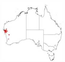
Acacia roycei occurrence map. Occurrence map generated via Atlas of Living Australia ( https://www.ala.org.au ).