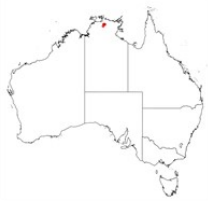
Acacia rigescens occurrence map. Occurrence map generated via Atlas of Living Australia ( https://www.ala.org.au ).