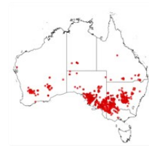
Acacia rigens occurrence map. Occurrence map generated via Atlas of Living Australia ( https://www.ala.org.au ).