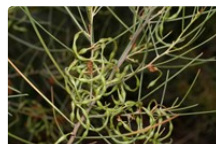
Source: Australian Plant Image Index (dig.19459). ANBG © M. Fagg, 2011