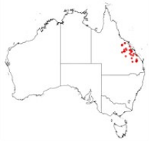
Acacia rhodoxylon occurrence map. Occurrence map generated via Atlas of Living Australia ( https://www.ala.org.au ).