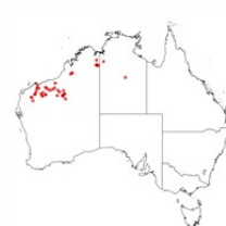
Acacia retivenea subsp. clandestina occurrence map. Occurrence map generated via Atlas of Living Australia ( https://www.ala.org.au ).