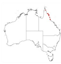
Acacia racospermoides occurrence map. Occurrence map generated via Atlas of Living Australia ( https://www.ala.org.au ).