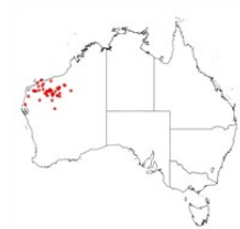
Acacia pyrifolia var. morrisonii occurrence map. Occurrence map generated via Atlas of Living Australia ( https://www.ala.org.au ).