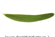
Source: WorldWideWattle ver. 2. Published at: www.worldwidewattle.com Kym Brennan