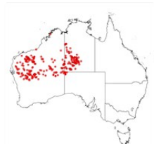
Acacia pruinocarpa occurrence map. Occurrence map generated via Atlas of Living Australia ( https://www.ala.org.au ).