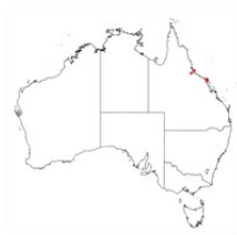
Acacia polyadenia occurrence map. Occurrence map generated via Atlas of Living Australia ( https://www.ala.org.au ).