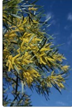
Source: Australian Plant Image Index (a.31250). ANBG © M. Fagg, 1999