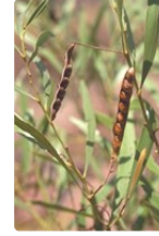
Source: WorldWideWattle ver. 2. Published at: www.worldwidewattle.com B.R. Maslin