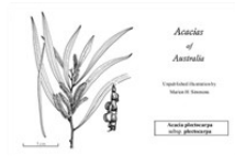
Source: WorldWideWattle ver. 2. Published at: www.worldwidewattle.com See illustration.