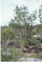
Source: WorldWideWattle ver. 2. Published at: www.worldwidewattle.com B.R. Maslin