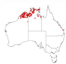
Acacia plectocarpa subsp. plectocarpa occurrence map. Occurrence map generated via Atlas of Living Australia ( https://www.ala.org.au ).