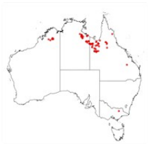
Acacia phlebocarpa occurrence map. Occurrence map generated via Atlas of Living Australia ( https://www.ala.org.au ).