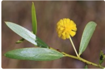
Source: WorldWideWattle ver. 2. Published at: www.worldwidewattle.com Kym Brennan