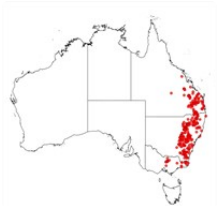
Acacia penninervis var. penninervis occurrence map. Occurrence map generated via Atlas of Living Australia ( https://www.ala.org.au ).