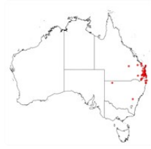
Acacia penninervis var. longiracemosa occurrence map. Occurrence map generated via Atlas of Living Australia ( https://www.ala.org.au ).

Source: WorldWideWattle ver. 2. Published at: www.worldwidewattle.com See illustration.