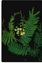
Source: Australian Plant Image Index (a.10034). ANBG © M. Fagg, 1993