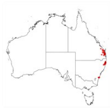
Acacia oshanesii occurrence map. Occurrence map generated via Atlas of Living Australia ( https://www.ala.org.au ).