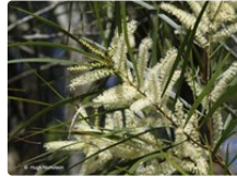
Source: WorldWideWattle ver. 2. Published at: www.worldwidewattle.com Hugh Nicholson