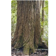
Source: WorldWideWattle ver. 2. Published at: www.worldwidewattle.com Hugh Nicholson