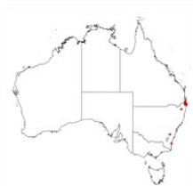
Acacia orites occurrence map. Occurrence map generated via Atlas of Living Australia ( https://www.ala.org.au ).