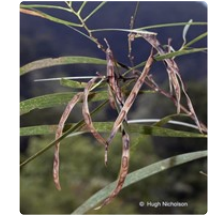
Source: WorldWideWattle ver. 2. Published at: www.worldwidewattle.com Hugh Nicholson