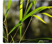
Source: WorldWideWattle ver. 2. Published at: www.worldwidewattle.com Hugh Nicholson