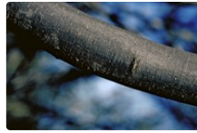
Source: WorldWideWattle ver. 2. Published at: www.worldwidewattle.com B.R. Maslin