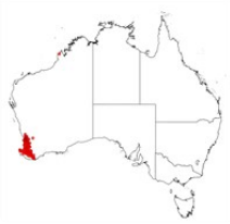
Acacia nervosa occurrence map. Occurrence map generated via Atlas of Living Australia ( https://www.ala.org.au ).