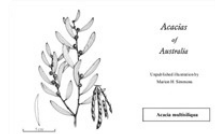
See illustration.