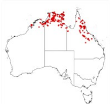
Acacia multisiliqua occurrence map. Occurrence map generated via Atlas of Living Australia ( https://www.ala.org.au ).