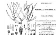
See illustration.