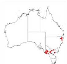
Acacia mitchellii occurrence map. Occurrence map generated via Atlas of Living Australia ( https://www.ala.org.au ).