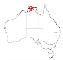
Acacia mimula occurrence map. Occurrence map generated via Atlas of Living Australia ( https://www.ala.org.au ).