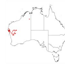
Acacia microcalyx occurrence map. Occurrence map generated via Atlas of Living Australia ( https://www.ala.org.au ).