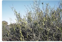
Source: WorldWideWattle ver. 2. Published at: www.worldwidewattle.com B.R. Maslin