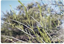
Source: WorldWideWattle ver. 2. Published at: www.worldwidewattle.com B.R. Maslin