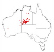
Acacia macdonnellensis subsp. macdonnellensis occurrence map. Occurrence map generated via Atlas of Living Australia ( https://www.ala.org.au ).