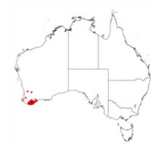
Acacia luteola occurrence map. Occurrence map generated via Atlas of Living Australia ( https://www.ala.org.au ).