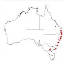
Acacia longissima occurrence map. Occurrence map generated via Atlas of Living Australia ( https://www.ala.org.au ).