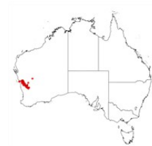
Acacia longiphylloidea occurrence map. Occurrence map generated via Atlas of Living Australia ( https://www.ala.org.au ).