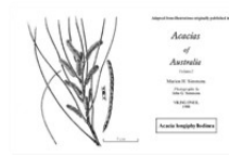
See illustration.