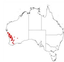
Acacia lineolata subsp. lineolata occurrence map. Occurrence map generated via Atlas of Living Australia ( https://www.ala.org.au ).