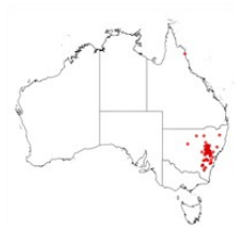
Acacia leucolobia occurrence map. Occurrence map generated via Atlas of Living Australia ( https://www.ala.org.au ).