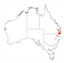
Acacia leuococlada subsp. argentifolia occurrence map. Occurrence map generated via Atlas of Living Australia ( https://www.ala.org.au ).

Source: WorldWideWattle ver. 2. Published at: www.worldwidewattle.com See illustration.