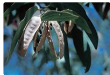
Pods. Irvinebank, Qld.