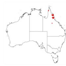
Acacia leptoloba occurrence map. Occurrence map generated via Atlas of Living Australia ( https://www.ala.org.au ).